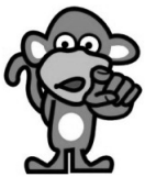
Who's Your MONKEY?!!?